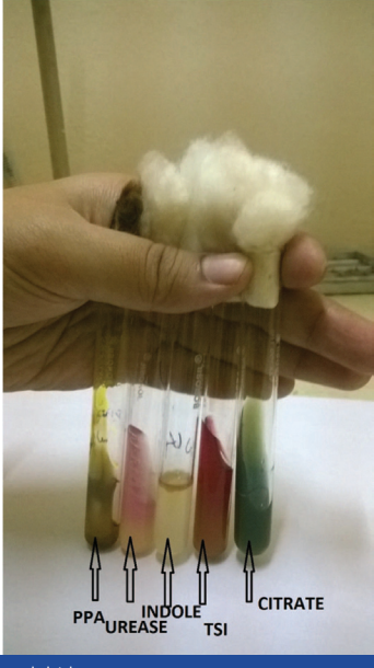
[Table/Fig-1]: Lesion of osteomyelitis below right knee. [Table/Fig-2]: Biochemical tests for identification.